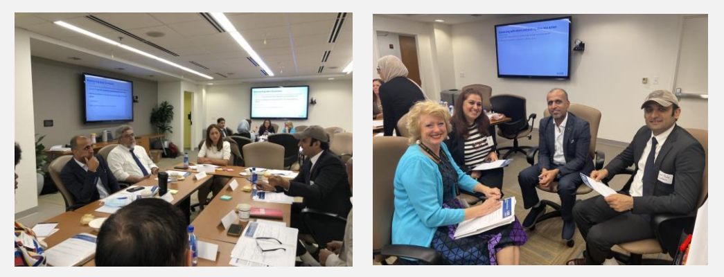
HEAR Learning Network participants engage in group activities to build a shared understanding of collaboration challenges and solutions.

The HEAR Learning Network included interactive learning sessions at each virtual meeting that were designed to encourage conversation and brainstorming and support collaboration and coordination in resettlement efforts. Network meetings were designed based on the HEAR project's research and input from experts, to create an engaging environment in which organizations could set expectations for partnerships in resettlement program implementation.