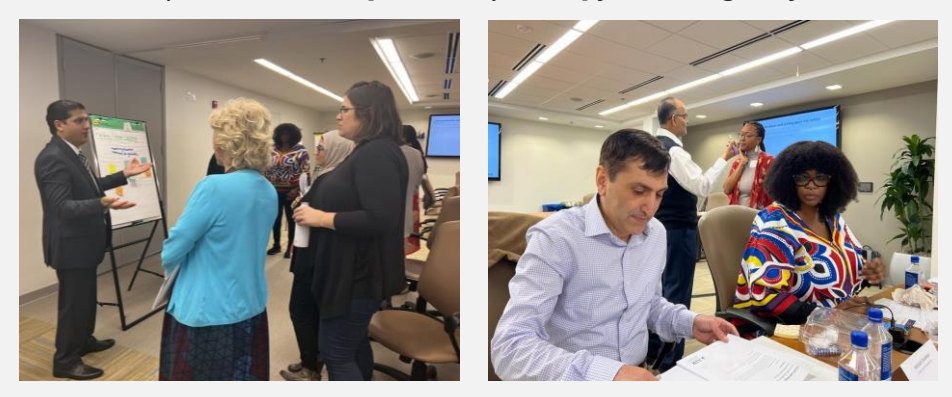
HEAR Learning Network members discuss and present solutions to collaboration challenges.

Participants of the HEAR Learning Network affirmed that the facilitated network helped them articulate their partnership priorities and barriers. Through ongoing conversation and discussions, they developed new partnerships, built on existing partnerships, and identified areas that could be strengthened. Moreover, through the HEAR Learning Network, participating organizations developed a resource inventory classifying the services and assets each organization could offer for refugee resettlement and integration efforts. Participants also developed a shared understanding of each other's work, priorities, and readiness to collaborate on resettlement efforts. One participant from a resettlement agency said, "With all the collective knowledge that this group has, it's important to remember that the answers to our questions are in the room." Another said, "I am excited that we identified shared passions and skills and resources that connect with interests that our organization has. As we prepare for a new project for [refugees] in January, we need partners here to discover about telemedicine, unaccompanied minors, [and many other] fields. So grateful to connect."