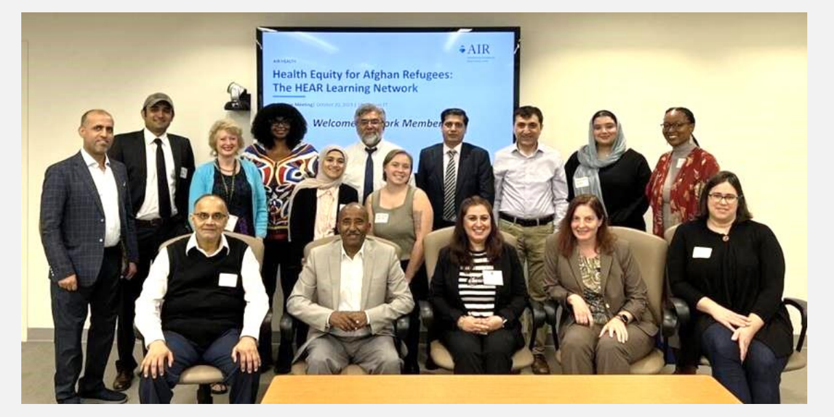
HEAR Project Team and Learning Network participants at an in-person meeting on October 20, 2023.

The HEAR Learning Network is a regional community of 11 organizations, including resettlement agencies, state and local health departments, and community-based organizations, that support refugee resettlement efforts in Washington, D.C., Maryland, and Virginia.<sup>35</sup> Network members share a common vision—improving the health and well-being of all refugees. As part of the HEAR project, members engaged with one another over 1 year to build and deepen their working relationships. Through participating in seven meetings (six virtual and one in-person), network members identified barriers to collaboration and worked through practical solutions that help them align their efforts with the priorities and concerns of Afghan refugees. At the end of the year, HEAR Learning Network members co-created actionable guidance to help network members and similar organizations connect and work together.